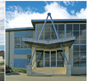
LEFT: INSIDE THE SOUTHLAND FREEMASONS CENTRE, INVERCARGILL